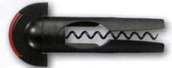
Corkscrew, with Teflon spiral