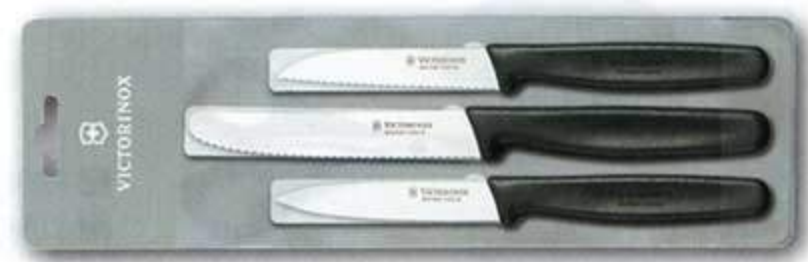
Paring knife set, 3 pieces