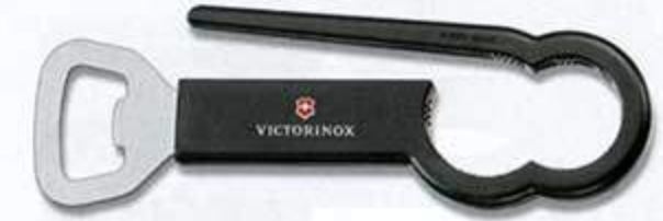
PET Bottle opener