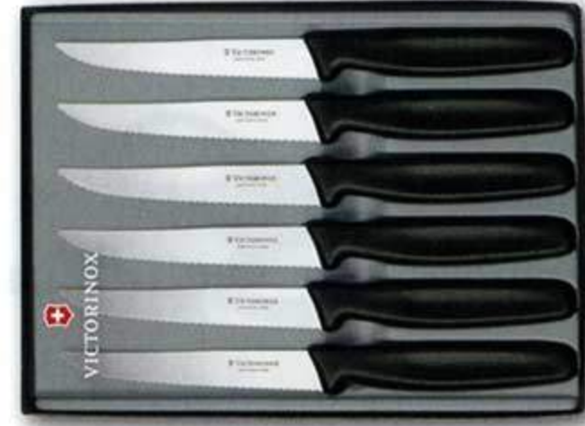
Steak knife set, 6 pieces