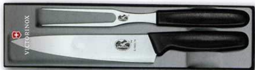
Carving knife set, 2 pieces