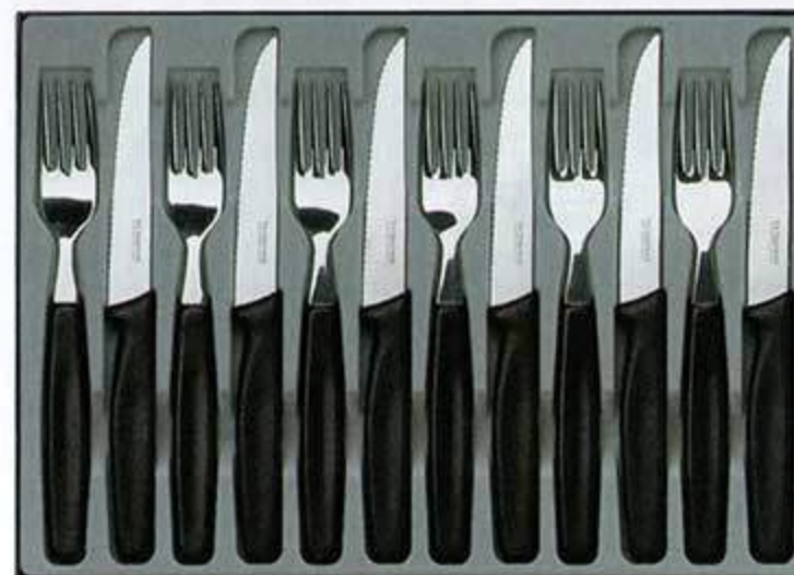
Tableware, 12 pieces