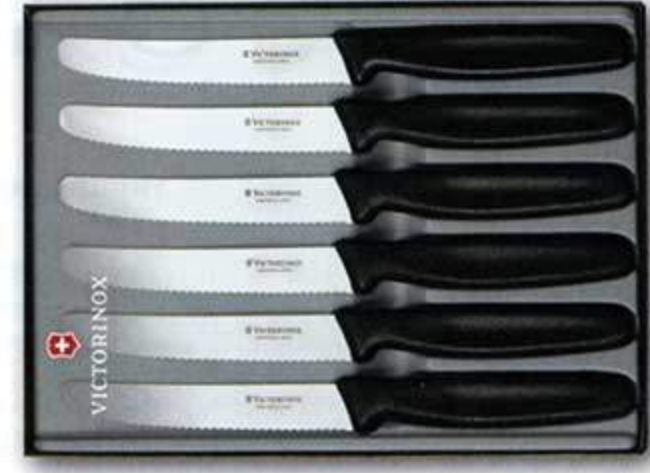
Table knife set, 6 pieces