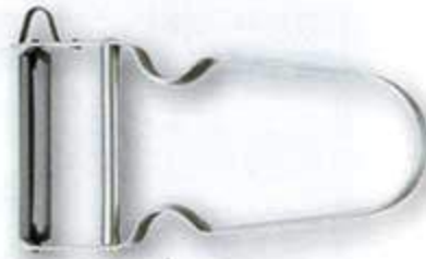
Potato peeler «Rex»