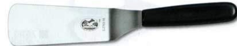
Spatula, shaped offset, spreading length 20 cm