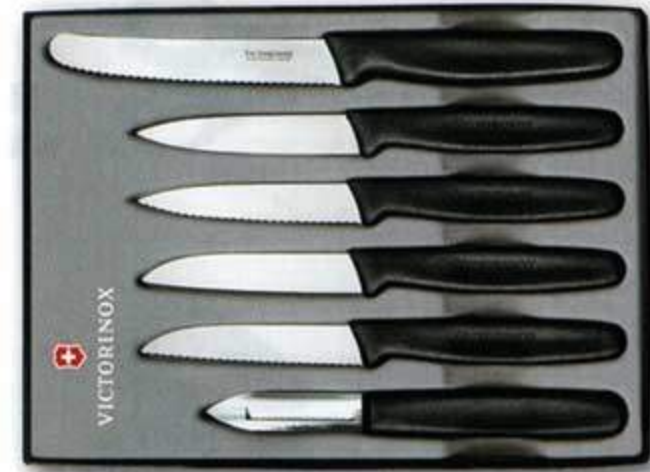
Paring knife set, 6 pieces