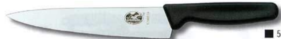
Carving knife, broad blade, 19 / 22 cm