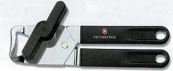
Universal can opener