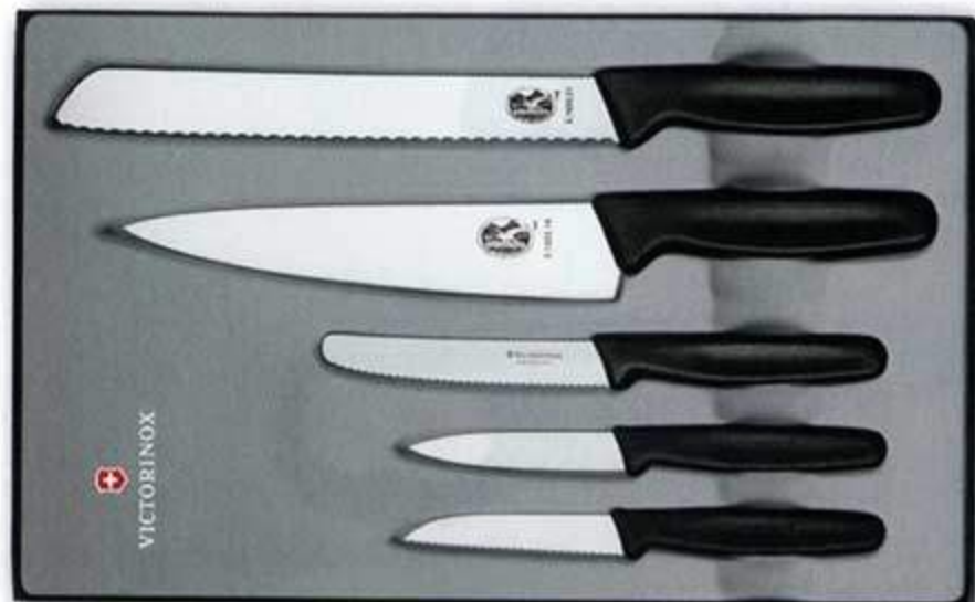
Kitchen set, 5 pieces