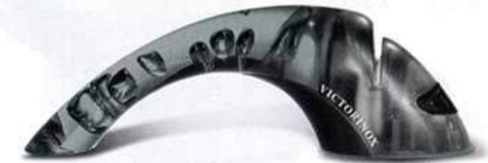
Knife sharpener, with ceramic rolls