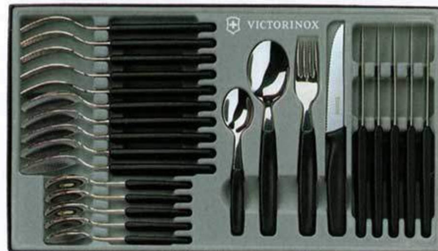
Tableware, 24 pieces