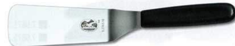
Spatula, shaped offset, spreading length 12 cm