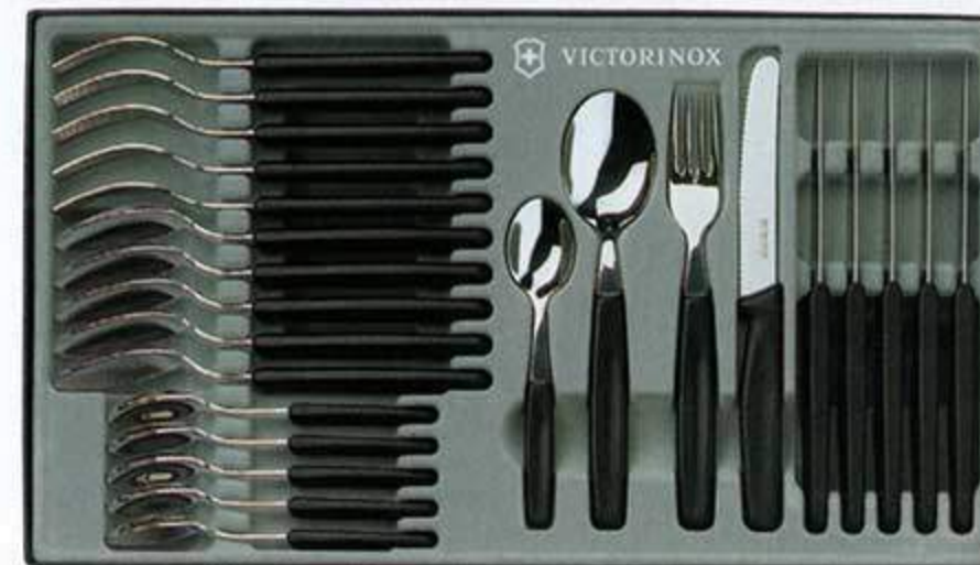
Tableware, 24 pieces